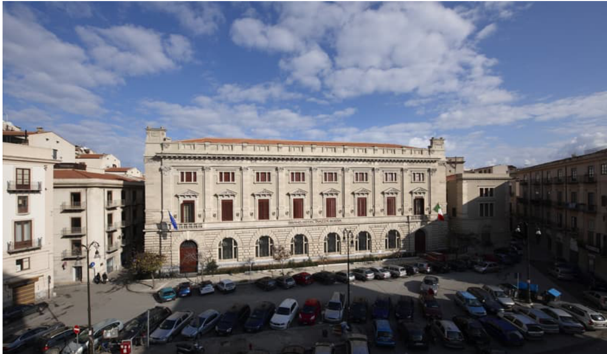
The Grand Hotel Piazza Borsa, Palermo.

Grand Hotel Piazza Borsa , https://piazza Borsa.it/ is a beautiful 4 star hotel in a great location surrounded by the historic old city of Palermo. The hotel in itself has a long history, the core of building around 500AD was originally a convent and a large church of the Fathers of Mercy, a monastic order who were famous in Palermo.