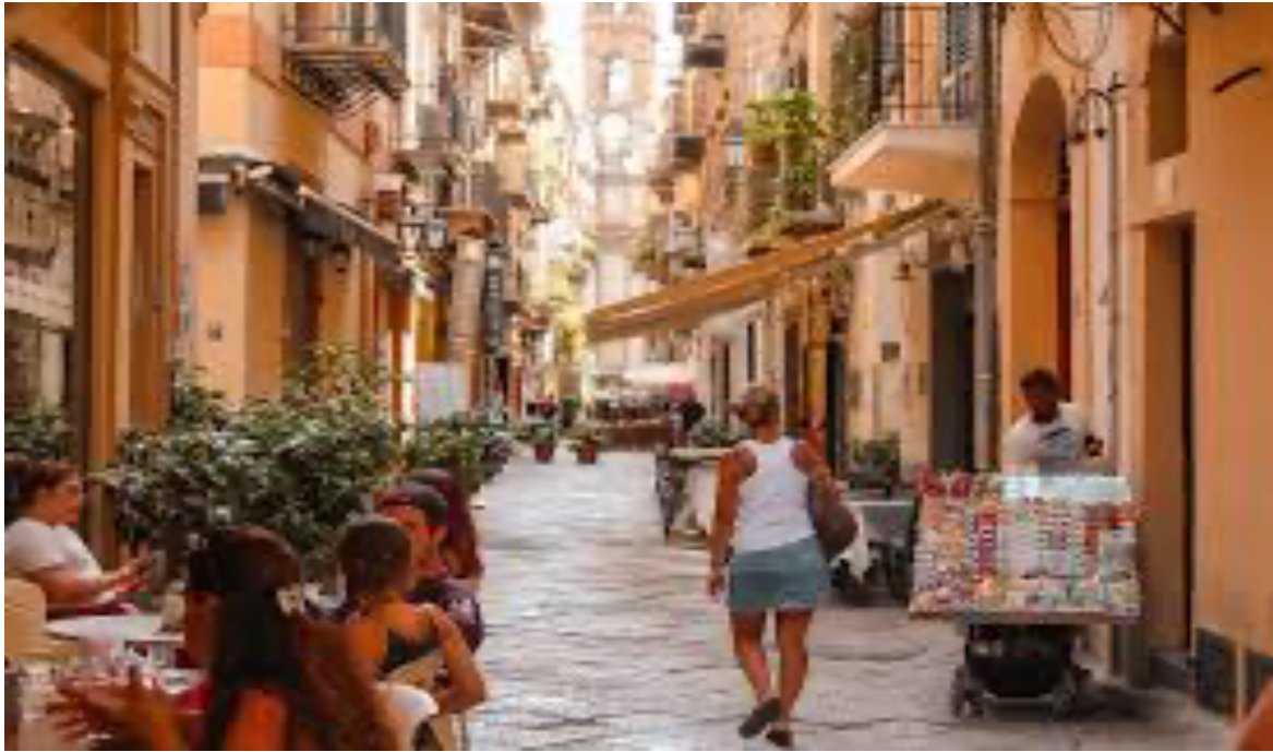
A typical street in Palermo..

Palermo, the regional capital of Sicily, is one of those cities with a very distinct, almost tangible atmosphere, a place of mystery, where reality often outperforms the traveller's imagination and preconceived stereotypes. It is a buzzing Mediterranean centre whose 1 million inhabitants are a fascinating cocktail of apparently conflicting characteristics.